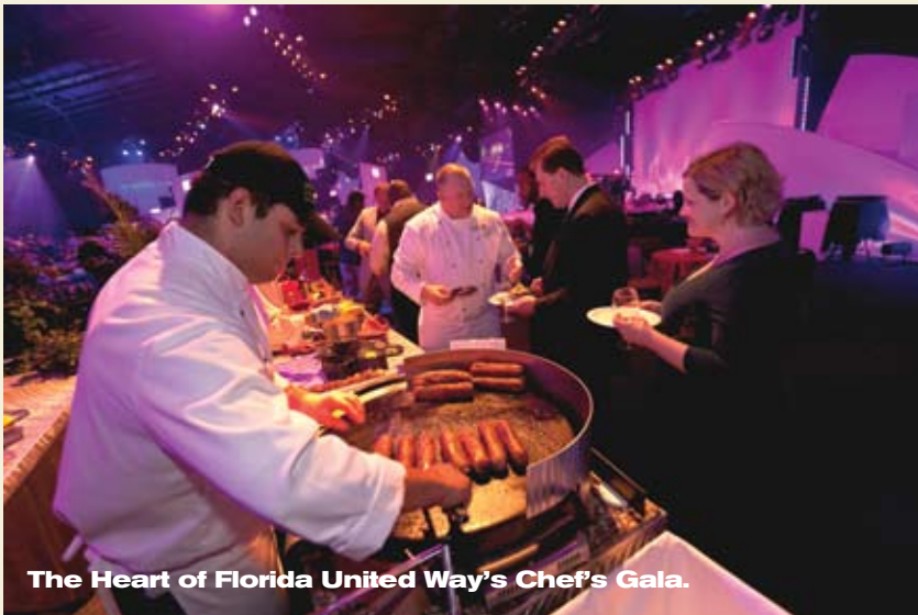
The Heart of Florida United Way's Chef's Gala.